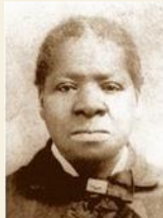
Biddu Mason (1818-1891)